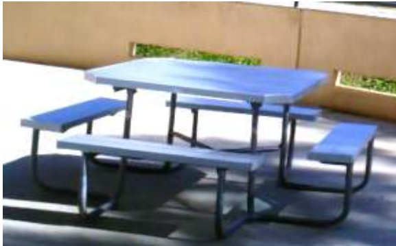
Remove old tables & benches: