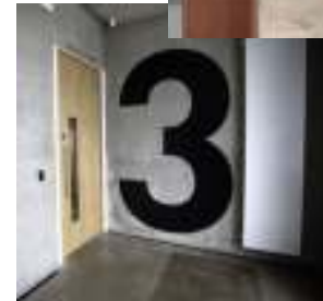
New graphic wayfinding: