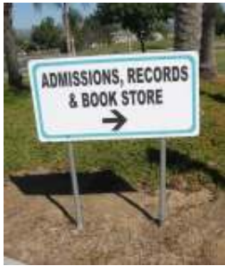
Existing Campus Signage: