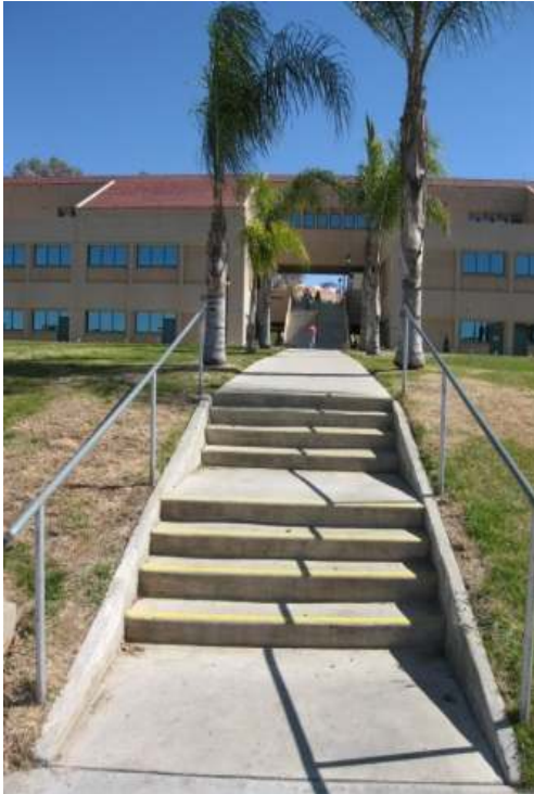
Existing Library entrance sidewalk & stairs: