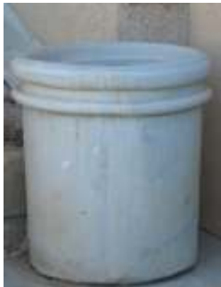
Remove or Paint concrete waste receptacles: