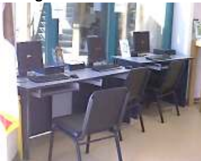
Existing Student Kiosk: