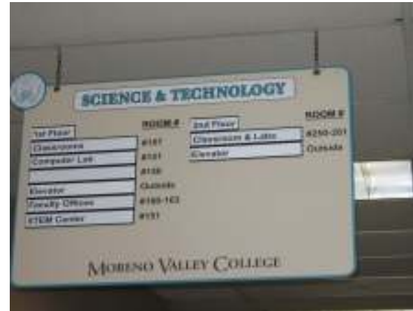
Existing corridor signage: