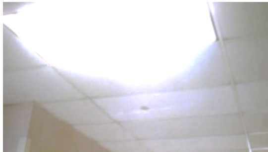
Existing corridor ceilings: