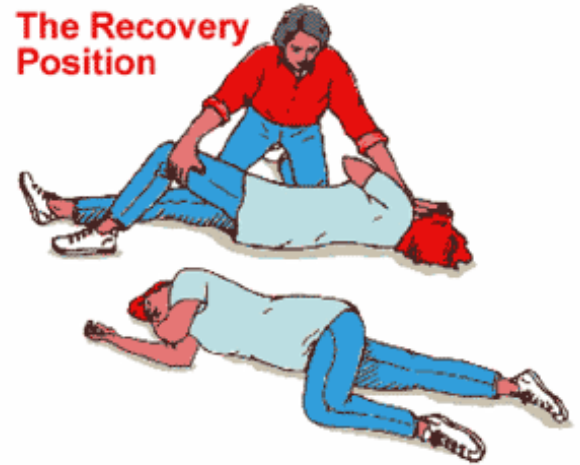
The Recovery Position