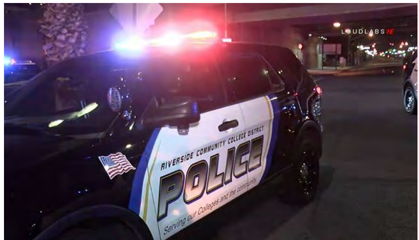
RCCD Police on scene at Sevilla night club

Early Monday morning, October 29, 2018, the Riverside Police Department and Riverside Community College District Police Department responded to multiple reports of a shooting at a downtown nightclub. The shooting was reported around 12:06am at Sevilla Nightclub in the 3200 block of Mission Inn Ave. When Officers arrived it was complete chaos as people were running from the nightclub as well as multiple fights breaking out in the parking lot and surrounding streets. At least one male was found